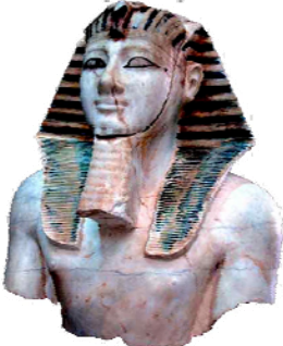
Thutmoses III Pharaoh of the Exodus 1485 - 1431 BC

Pharaoh Quran 7:104-137, 8:52, 8:54, 10:75-90